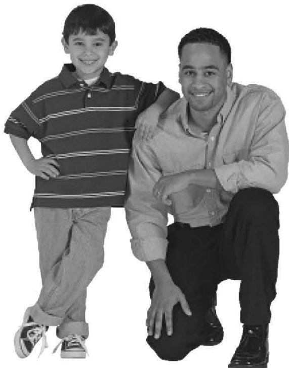
The Learner-Centered Schools